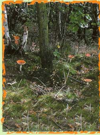
Fly agaric in Wath Wood

The boundary bank surrounding Boyd Royd Wood is obviously an important archaeological feature. Even more important is the prehistoric linear earthwork called the Roman Ridge. This runs north of Birch Wood and is also a prominent feature in Wath Wood. In both cases it formed the ancient parish boundary between Wath and Swinton. There is still debate about the function of the earthwork and the date of its construction.