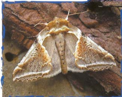
Buff arches moth